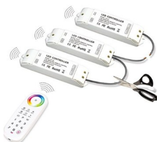
R4-5A Wiring Diagram