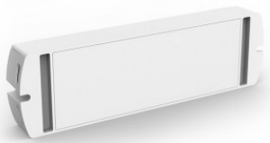
Mechanical Structures and Installations

Brand SKYDANCE Dimmable DMX / TRIAC Output 200W In package 1pc Casing material plastic Polishing matt